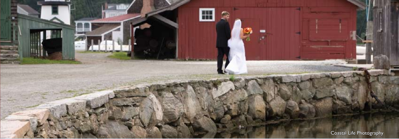
Coastal Life Photography