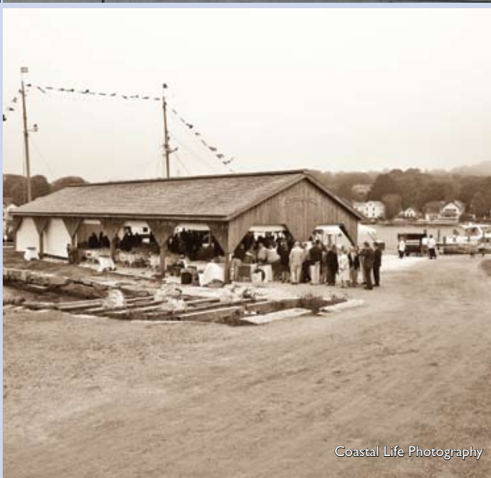
Coastal Life Photography