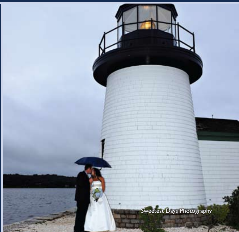
Sweetest Days Photography