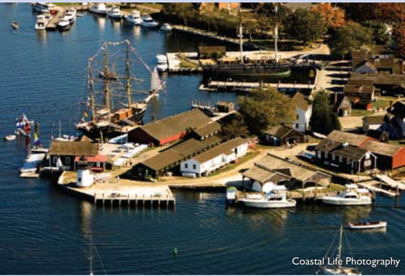
Coastal Life Photography