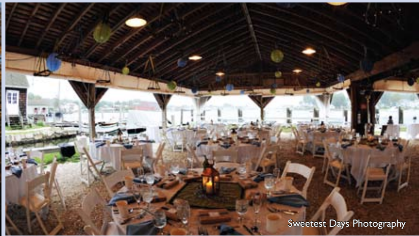
Sweetest Days Photography