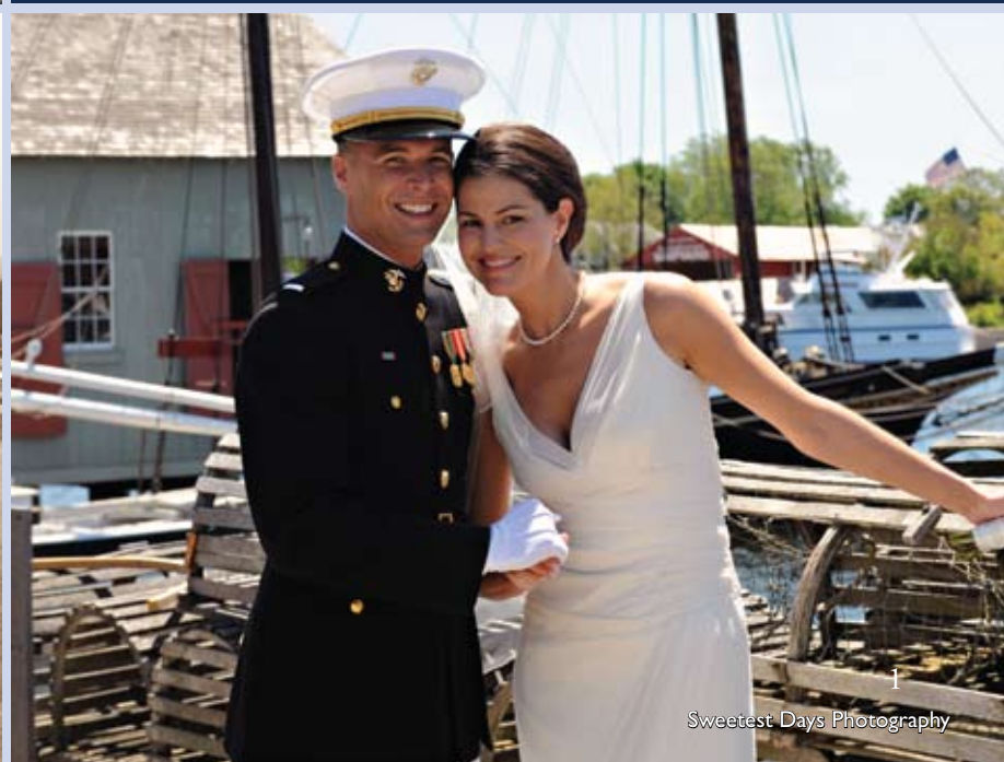
Sweetest Days Photography