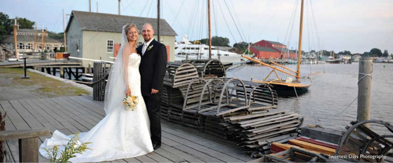
Sweetest Days Photography