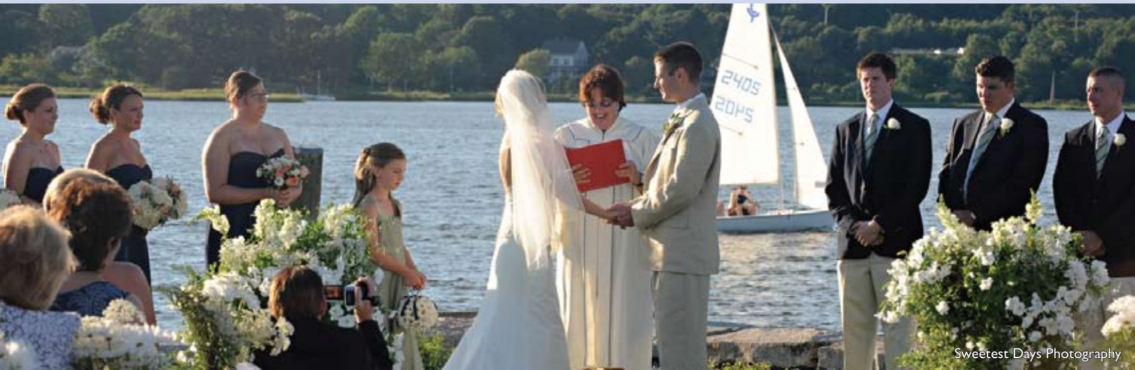
Sweetest Days Photography