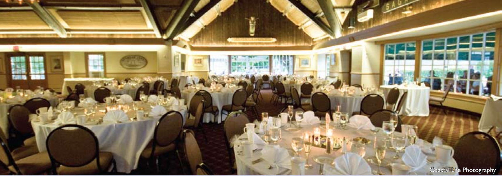
Coastal Life Photography