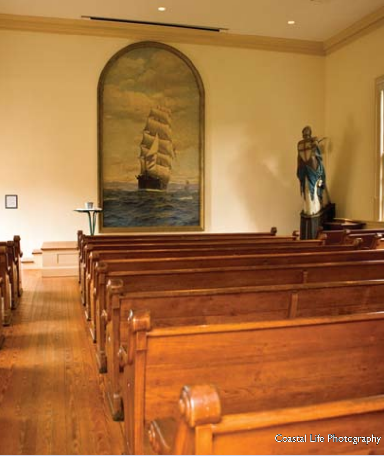
Coastal Life Photography